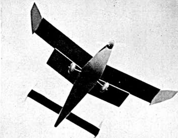
Good tight turn in the glide is quite apparent in this gliding shot.

Several flights and a few collisions with stationary objects later, Little Red Twin was still in one piece and rarin' to go. If you'd like to add a small indestructible flier to your stable, you too can make use of those windy afternoons when wings are folding like umbrellas and downwind landings are wiping out calm weather jobs.