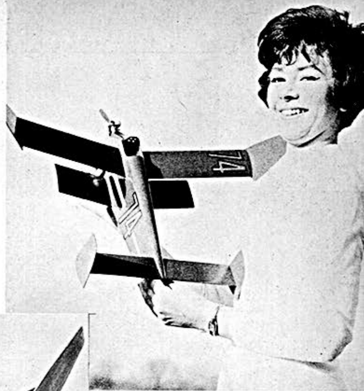
Here the little bird is up against stiff competition, it still holds its own in the looks dept.